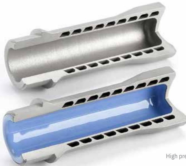
Fig. 5: High pressure reactor before and after enameling