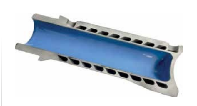
Fig. 1: Prototype, glass-lined high-pressure reactor

The combination of enameling the interior surface and integrated temperature control channels in the reactor's walls provides significantly improved heat transfer than